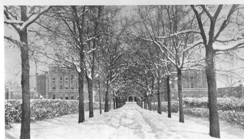
THE AVENUE IN WINTER