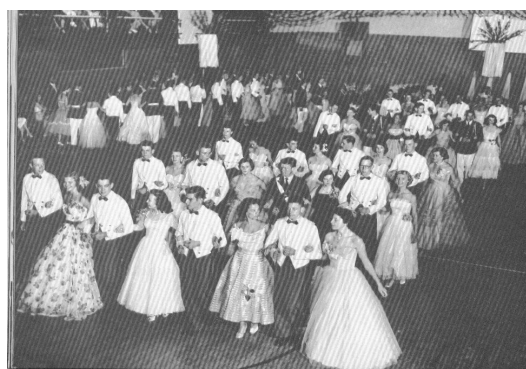
Grand March at Graduation Ball held in the Gymnasium in 1953